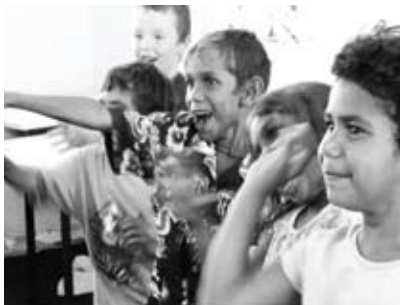
Children participating in The Michael Leslie Pilbara Performing Arts Program, who have named themselves the Yirramugardu Majik Binbilas (translates as the Roebourne Magic Grasshoppers). This is an arts program that addresses young Indigenous people in remote and disadvantaged areas.

Since its creation, Artsupport Australia has facilitated over $15 million of philanthropic donations and grants to