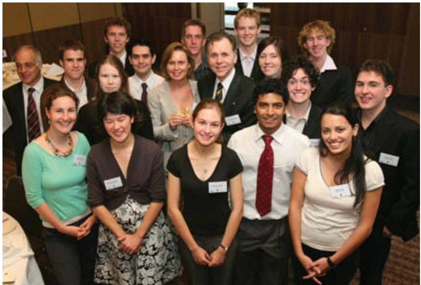
The UWA Fogarty Scholars and Nobel Laureate Professor Barry Marshall at a Leaders Series event.

An example of this is where a number of our partners are working with educating children in a disadvantaged area of Perth. Through bringing the partners together they have been able to share their knowledge and are now all contributing to the new venture of a full-service primary school, where parents are able to access facilities such as the child health nurse, social workers and government agencies all at the one site. This will include Edith Cowan University hosting The Fogarty Learning Centre, an on-site training and demonstration facility, for their student teachers, and possibly social workers and behavioural science students.