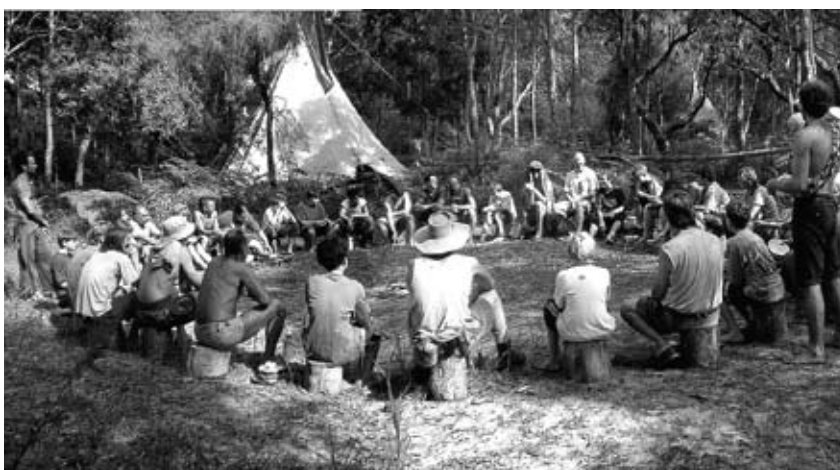
A circle of participants and leaders around a fire on a recent Pathways to Manhood program. There are many opportunities during a program to gather and share stories.

I first met Drayton in early 2002. A bookish, quietly spoken figure whose resume includes stints at McKinsey & Co. and shaping environment policy with the Environment Protection Agency in the Carter administration, he is regarded as the global pioneer of social entrepreneurship and was recently recognized as one of America's Best Leaders. I was fortunate to spend some time talking with him about the need for social innovation and entrepreneurship and about the opportunity for it in Australia. This meeting was deeply